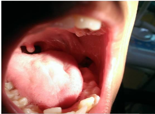
Fig. 2 a: (right hand side) photograph showing intra-oral firm swelling extending from 36 to anterior border of ramus along with lingual cortical plate expansion. Exophytic growth at the socket of 37